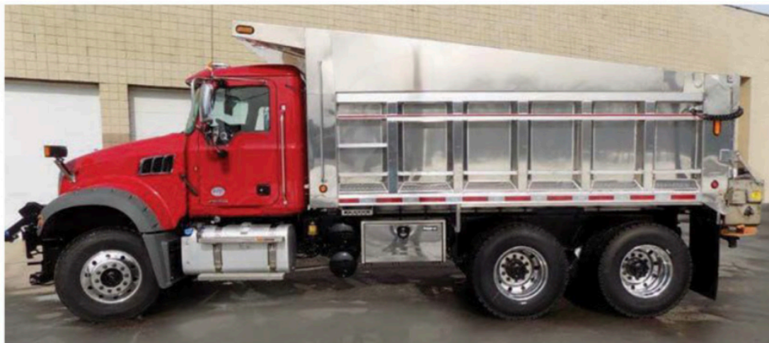
A&H Equipment's 14-foot, custom aluminum body with double-acting trunnion-mounted hoist, aluminum side panels, panel tarp, UTG SS spreader, plow hitch and central hydraulics, and stainless steel toolbox. Learn more at ahequipment.com .