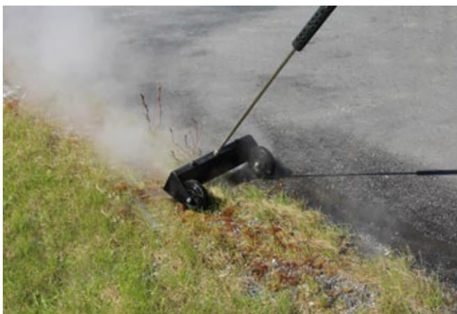
Optional weed control nozzle kit WD04