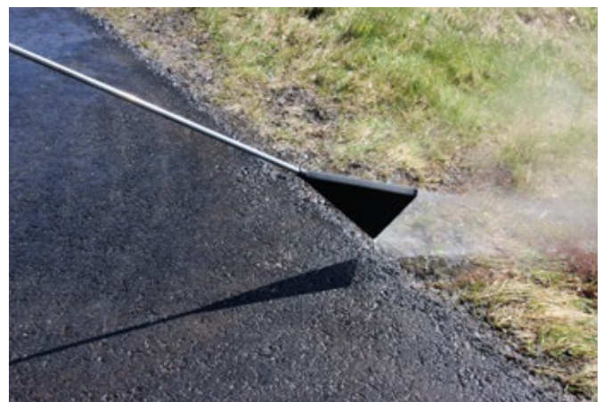
Optional weed control nozzle kit WD01