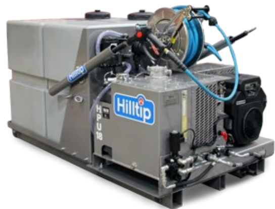
Power Jet-It™ Combi 1000 l

The Power Jet-It™ Combi is designed for installation onto pickups, flat beds, trailers and other similar vehicles. The Combi unit is available in two different watertank capacities, 500L and 1000L. The total length of the 500L model is only 135cm. This makes it fittable on even Double-Cab Pickups!