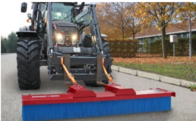
SweepAway™ medium series, with 12 brush rows