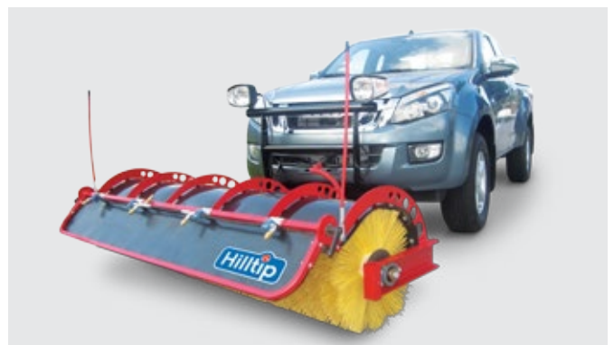
SweepAway™ rotary broom on pickup