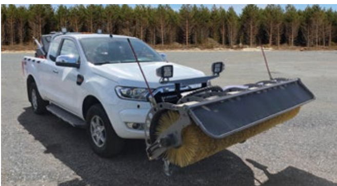
SweepAway™ rotary broom and Power Jet-It™ Combi 1000 l on pickup

The 20 meter hose-reel with an solid stainless-lance will allow you to be flexible and efficient in all situations.