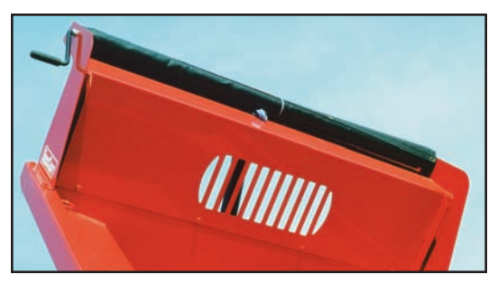
The dump body protects the truck cab, rear window and storage compartments. A roll-up nylon-reinforced lumite tarp that covers the entire load is available for TC-300 series bodies.