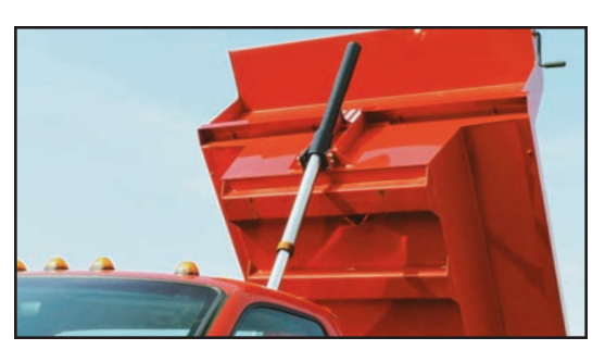
The TC-300 Series Hoist is a 6 ton, 3-stage telescopic type, powered by an electrohydraulic pump that can be used with automatic transmissions.