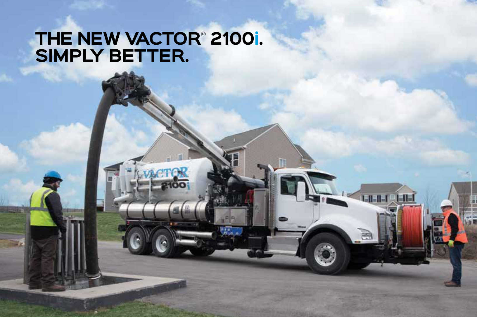
intuitive. intelligent. innovative. individualized. incomparable.

These words describe the new Vactor 2100i. Add it all together and you have a machine that combines proven performance with a new level of simplicity and ease. With an emphasis on ergonomics, Vactor has engineered an array of innovations that together speeds work, reduces fatigue on your operators, and lets them focus on the work in front of them, not the machine behind them. Among the host of innovations you'll find on the 2100i are: