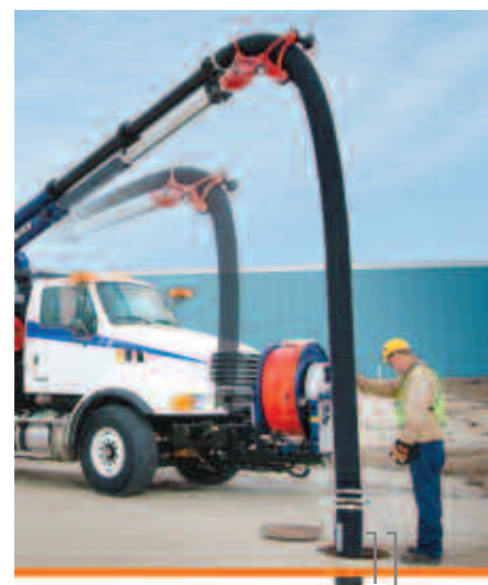
The new CB nozzle adds five feet of length to reach down into catch basins or sewer holes with ease.