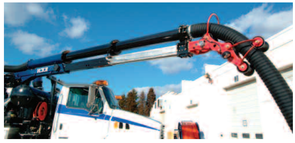
The new Vactor 5x5 boom telescopes outward five feet and allows the hose to move downward an additional five feet. Movement is controlled by a convenient wireless remote (optional).