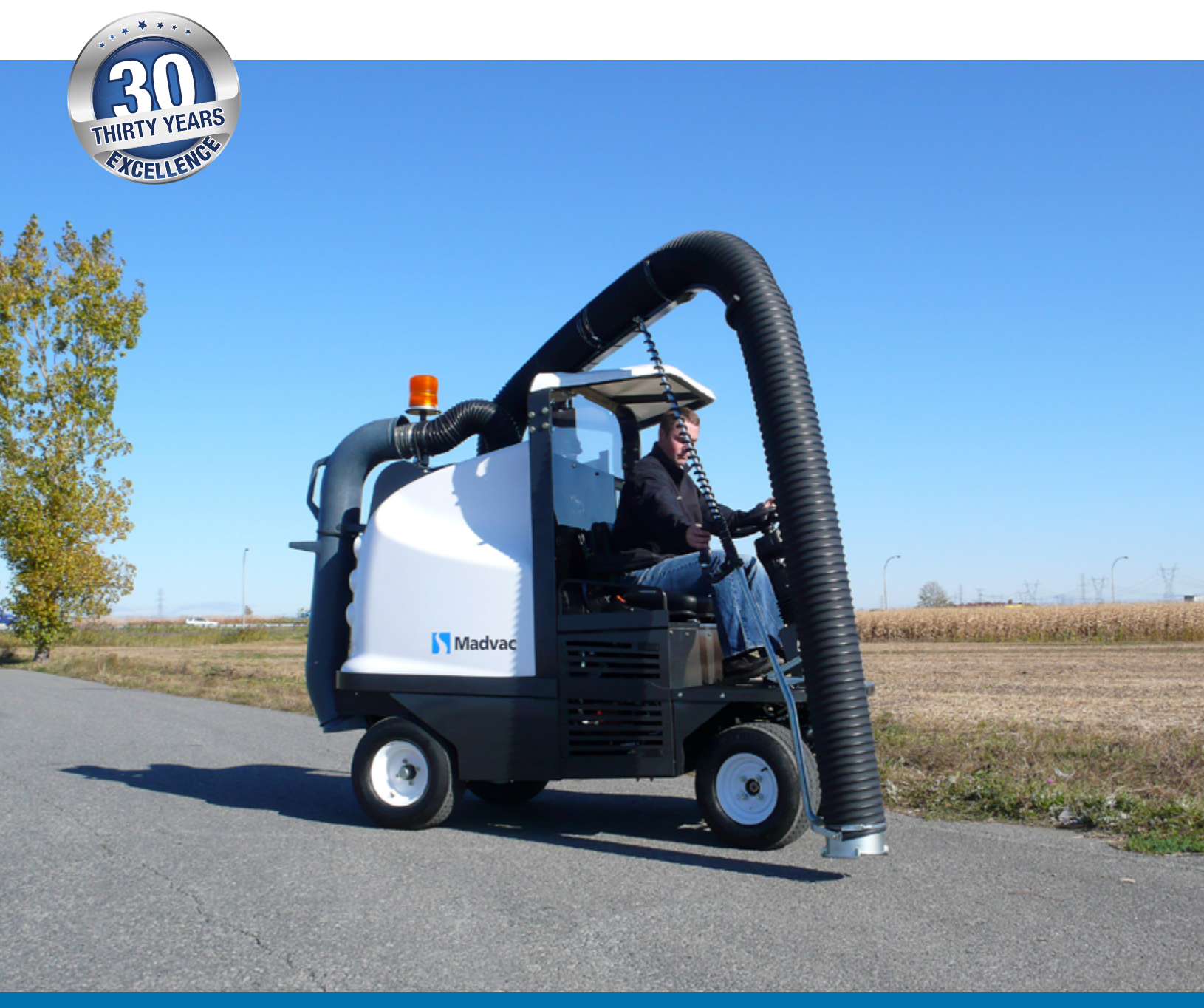
Madvac® LN50 — Compact Litter Vacuum