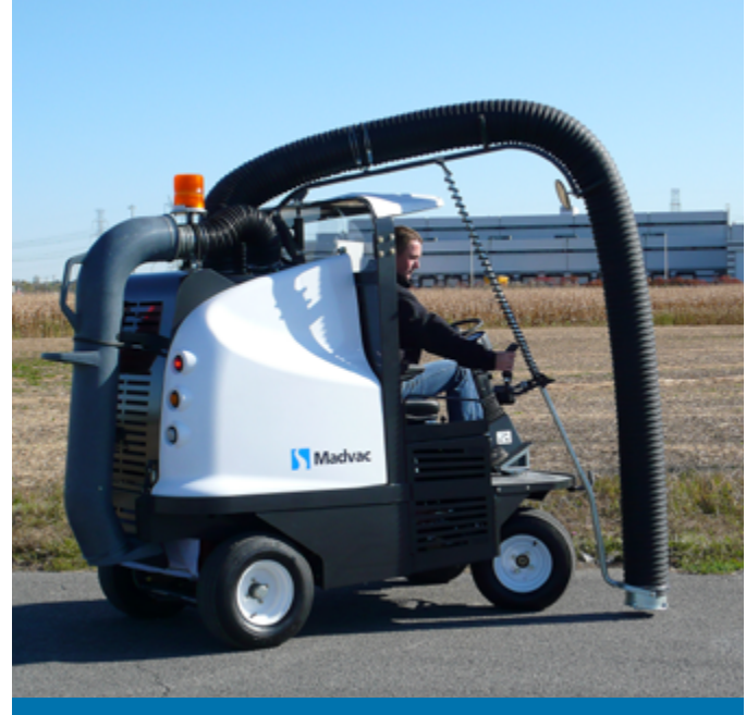
ABOVE Hydraulic arm controlled via a joystick

The Madvac® LN50 litter collector is used worldwide because: It works. It lasts. It pays for itself. Fast!