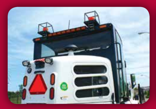
LIGHTING PACKAGES A variety of lighting packages are available for the Pelican to enhance safety and visibility.