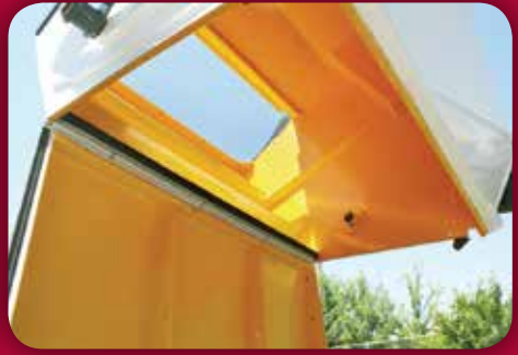
LIFELINER® HOPPER SYSTEM The LifeLiner system is a specially designed hopper liner and finish system that greatly improves the life, durability, and functionality of a sweeper hopper.