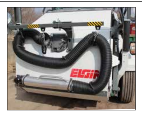
Front Debris Hose

The LifeLiner<sup>®</sup> Hopper system is a specially designed hopper liner and finish system that greatly improves the life, durability, and functionality of a sweeper hopper.