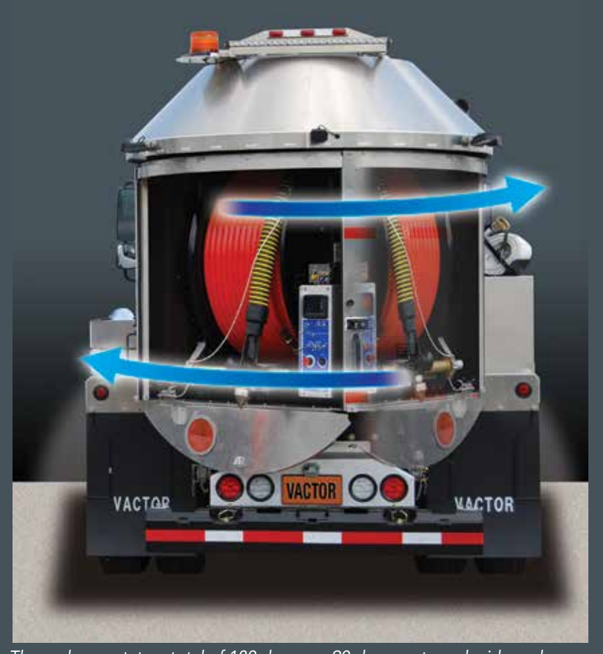
The reel can rotate a total of 180 degrees, 90 degrees to curb side and 90 degrees to street side providing direct alignment to manholes.