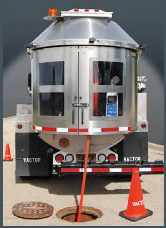
The revolutionary rotating hose reel with integral shroud.