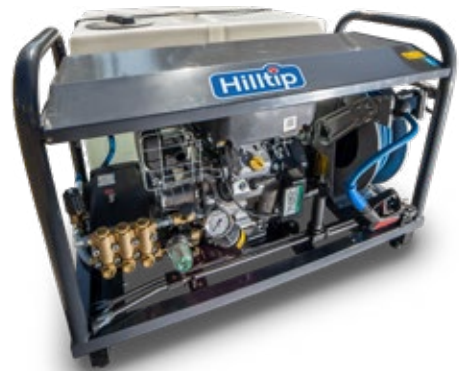
Jet-It™ HT2025ES cold water pressure washer

These versatile 350-1000 l mobile pressure washers are designed for use on pickups, trailers, tractors and other similar equipment. Their wide application areas enable easy washing/spraying of yards, graffiti, gardens, pavements, stairs, roofs, machines, facilities etc.