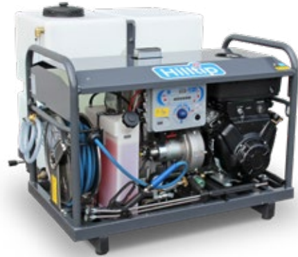
Jet-It™ HT2025H hot water pressure washer

With the optional weed control kits it's easy to get rid of weeds on walkways and cracks in driveways. Hot water kill weeds ecologically and the treated area is safe to use immediately after the treatment.