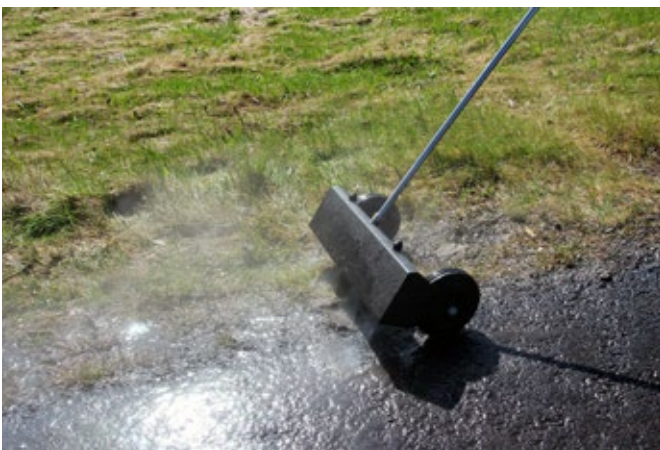
Optional weed control nozzle kit WD 04