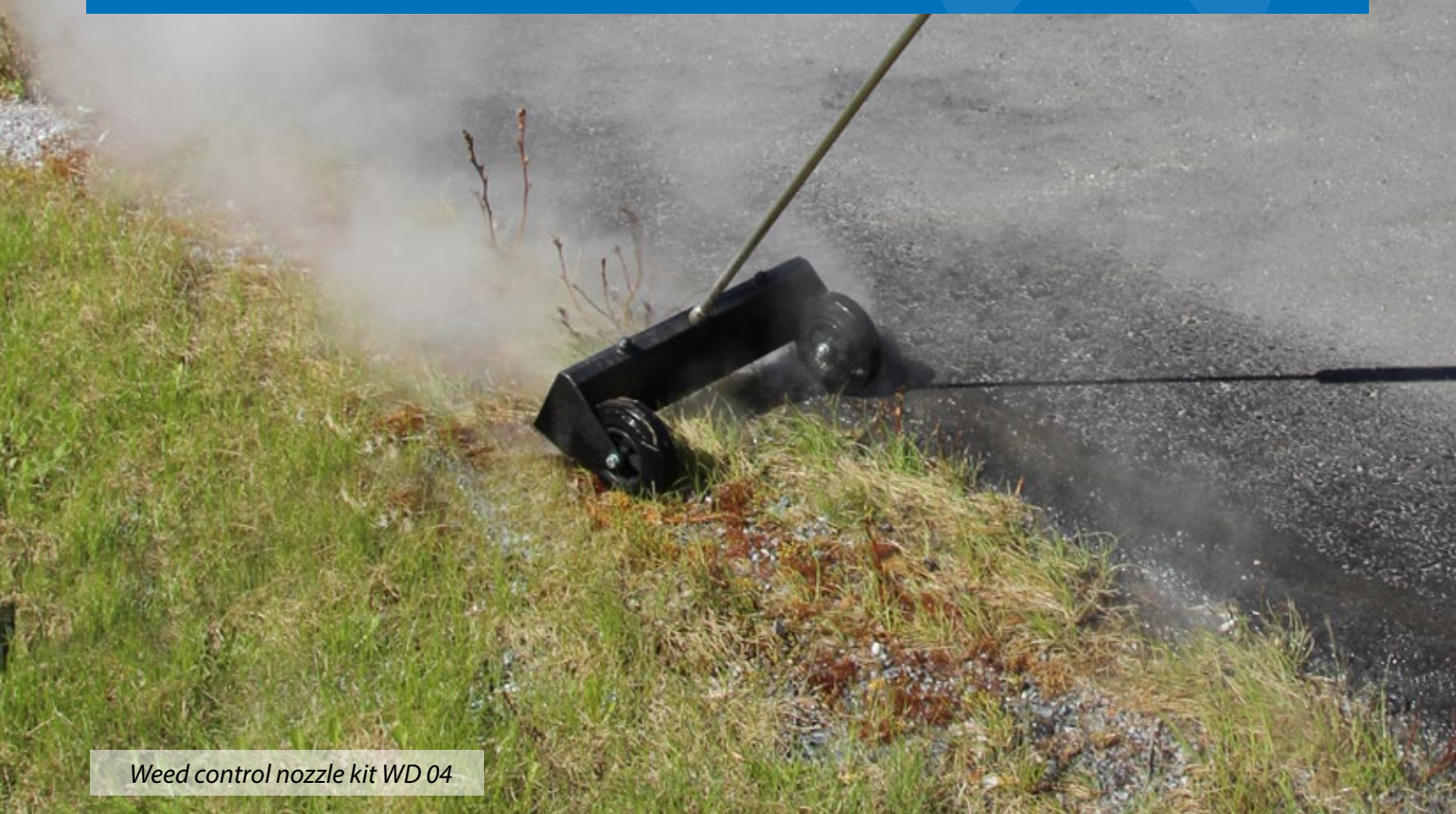
Weed control nozzle kit WD 04