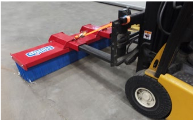
SweepAway™ with attachment for forklift