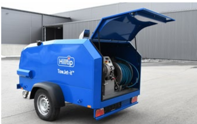
TowJet-it™ towable hot pressure washer

The total weight of the trailer is 1600 kg.