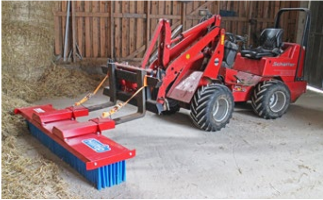
The SweepAway™ can handle a variety of materials, such as leaves, sand, rocks, debris, snow, slush etc.