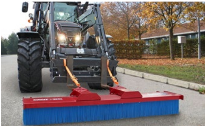
SweepAway™ medium series, with 12 brush rows