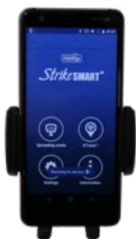
StrikeSmart™ Smart phone control