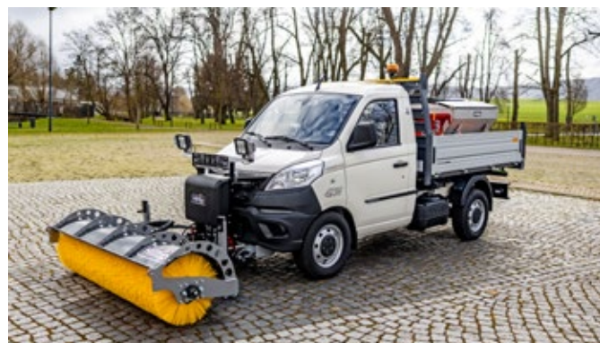
SweepAway™ rotary broom on pickup