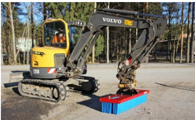
SweepAway™ on excavator